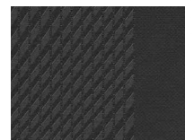
Black (MID grade)