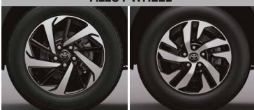
17 inch 6.5J (HIGH grade)