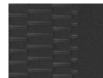
Black (HIGH grade)